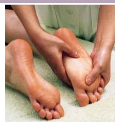
Figure 3: Neuropathy in the feet can produce debilitating pain and numbness.

Recent research suggests that these non-traditional therapies can and do help patients suffering from neuropathy. Not only do they provide subjective relief of numbness and pain, but they actually restore nerve function as measured by electromyography and other sophisticated nerve tests.