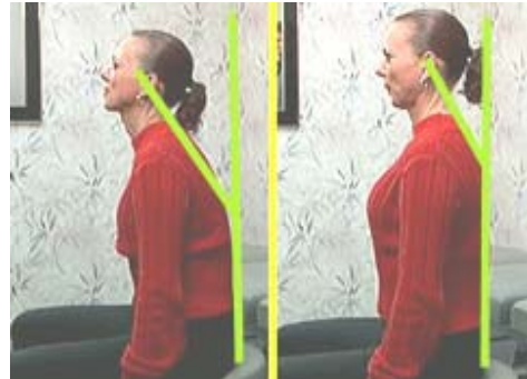
Changes in posture following a treatment with the ABC